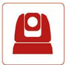
PTZ CAMERA CONTROL

Everything you need from a professional video system .